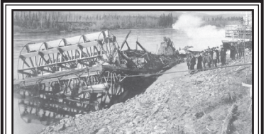
WRECKAGE of the COLUMBIAN – The charred hull, which was a menace to navigation, was floated downstream a short way and abandoned in "Columbia" slough.