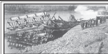
WRECKAGE of the COLUMBIAN – The charred hull, which was a menace to navigation, was floated downstream a short way and abandoned in "Columbia" slough.