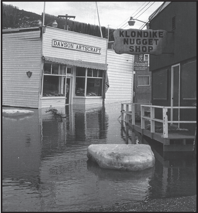
AFTER THE FLOOD - Two souvenir shops here, Dawson Arts Crafts and the Klondike Gold Nugget shop, once stood side by side, close to the Yukon River, but now they are barely upright and are facing each other. The tremendous power of the river water gushing over Front Street early Thursday morning has turned them around.