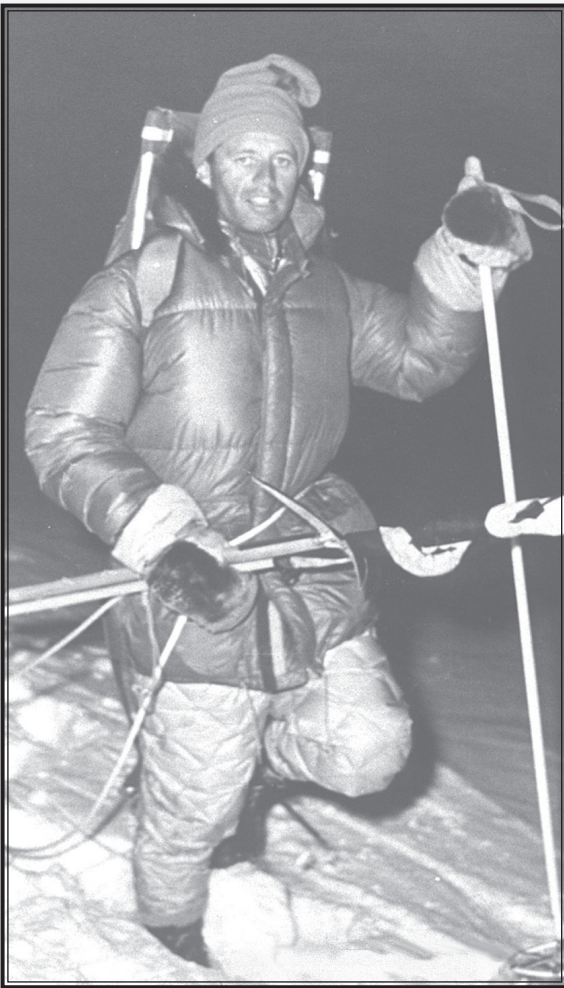
HE DID IT! Bobby Kennedy strides into camp after climbing Mount Kennedy.