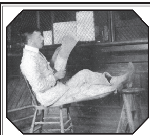
THE BARD OF THE NORTH- Robert Service in the Whitehorse Bank of Commerce ca. 1907.

LUCKY DRAGON RESTAURANT in Haines Junction is looking for kitchen helper NOC6711, permanent full time, mature, reliable. Room & board included $25/hr. Fax resume to 867-634-2763.