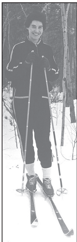
Whitehorse STAR photo MARTHA BENJAMIN - 1963