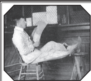
THE BARD OF THE NORTH- Robert Service in the Whitehorse Bank of Commerce ca. 1907.

LUCKY DRAGON RESTAURANT in Haines Junction is looking for kitchen helper NOC6711, permanent full time, mature, reliable. Room & board included $25/hr. Fax resume to 867-634-2763.