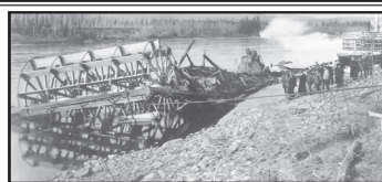
WRECKAGE of the COLUMBIAN – The charred hull, which was a menace to navigation, was floated downstream a short way and abandoned in "Columbia" slough.