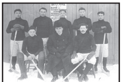
THE KLONDIKE HOCKEY TEAM at Dey's Rink in Ottawa, January 14, 1905.

LOTTO MAX (Oct 12) 7, 11, 13, 30, 38, 40, 43 The Bonus Number was: 45 WESTERN MAX (Oct 12) 4, 8, 17, 19, 20, 29, 38 The Bonus Number was: 32 PICK GAMES (Oct 11) 27, 293, 3438 (Oct 12) 96, 972, 2549 EXTRA (Oct 11) 5013746 (Oct 12) 2175081 DAILY GRAND (Oct 11) 11, 15, 19, 34, 42 The Grand Number was: 4 POKER LOTTO (Oct 11) 8H, QH, 9C, JC, 4D (Oct 12) 8S, KS, 3C, AD, D