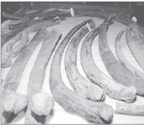
Spare Ribs - These ribs belonged to a sub-adult mammoth.

"It's our desire, if we took the time to stake it out and left the area intact to preserve the animal, we'd like to see them take it a step further and do something with it," says Ross.