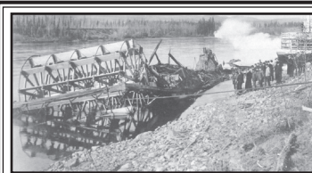
WRECKAGE OF THE COLUMBIAN - The charred hull, which was a menace to navigation, was floated downstream a short way and abandoned in "Columbia" slough.