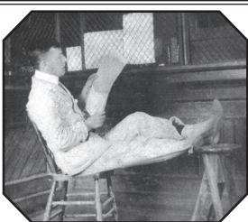
THE BARD OF THE NORTH- Robert Service in the Whitehorse Bank of Commerce ca. 1907.