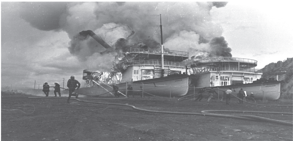
A SPECTATOR runs to aid firemen as they move to a new position, but there's no hope for the old, tinder dry, boats.

From the Whitehorse STAR, Friday, June 21, 1974