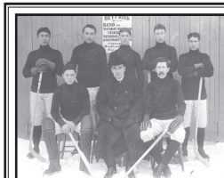
THE KLONDIKE HOCKEY TEAM at Dey's Rink in Ottawa, January 14, 1905.

FIDDLEHEADS ANNUAL GENERAL meeting is Monday, September 27th, 6pm at F.H. Collins School.