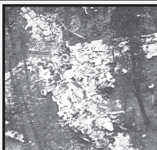
Strangely intact among undamaged trees, wreckage of DC6B as seen from the air.