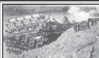
WRECKAGE of the COLUMBIAN – The charred hull, which was a menace to navigation, was floated downstream a short way and abandoned in "Columbia" slough.