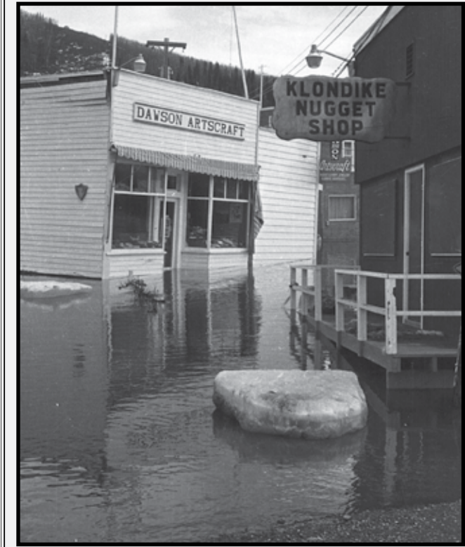
AFTER THE FLOOD - Two souvenir shops here, Dawson Arts Crafts and the Klondike Gold Nugget shop, once stood side by side, close to the Yukon River, but now they are barely upright and are facing each other. The tremendous power of the river water gushing over Front Street early Thursday morning has turned them around.