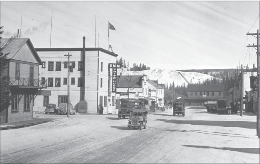
WHITEHORSE DURING THE 1940'S - The Bank of Commerce is to the immediate left. The three story white building is the Whitehorse Inn. The White Pass train depot is at the end of the street, with the Whitehorse Theatre to the immediate right.