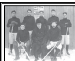
THE KLONDIKE HOCKEY TEAM at Dey's Rink in Ottawa, January 14, 1905.

ALL THE COWBELL you want, free sing along, play along online every two weeks. Mondays Jan 18th-Mar 29th, 7pm. It's just fun. www.wittheatre.ca .