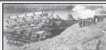
WRECKAGE of the COLUMBIAN – The charred hull, which was a menace to navigation, was floated downstream a short way and abandoned in "Columbia" slough.