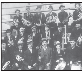
The FIRST WHITEHORSE BIG BAND

The White Horse Star, February 27, 1901 For more history go to www.whitehorsestar.com and click on “History”