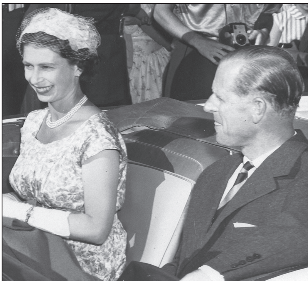
ROYALTY IN WHITEHORSE. The Queen and the Duke of Edinburgh riding in a 1959 Ford Fairlane borrowed by the RCMP at the last minute from Whitehorse Motors. A convertible was requested because of the sunny day in Whitehorse.

Then a very unusual thing occurred. The press gave three cheers for the Territorial Government the White Pass and the people of the Yukon Territory.