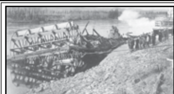
WRECKAGE of the COLUMBIAN - The charred hull, which was a menace to navigation, was floated downstream a short way and abandoned in "Columbia" slough.