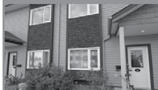
Energy Efficient Condo!

3 Bed, 2 Bath. ID# 143210 $341,500 867-322-1230