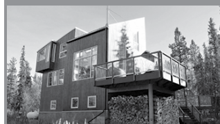
Quiet Cowley Creek

3 Beds, 2 Bathrooms ID#143216 $649,000 1-867-322-1230