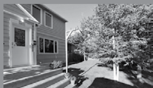
Location & Upgrades!

3 Bedroom, 1 Bath ID#143215 $409,500 867-322-1230