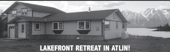
LAKEFRONT RETREAT IN ATLIN!

2 business days prior to publication date.