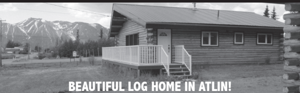
BEAUTIFUL LOG HOME IN ATLIN!

Newly renovated home on LARGE waterfront lot ATLIN TOWNSITE! | 134 Lake Street | $769,000